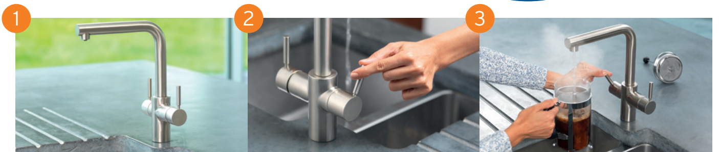
1 Contemporary Italian design